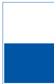
Half Page 10 X 8