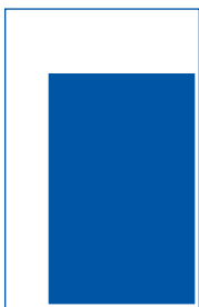
Junior Page 7 3/8 X 11