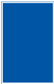
Full Page 10 X 15.75