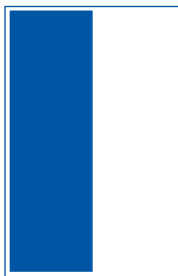
Half Page 4 7/8 X 15.75